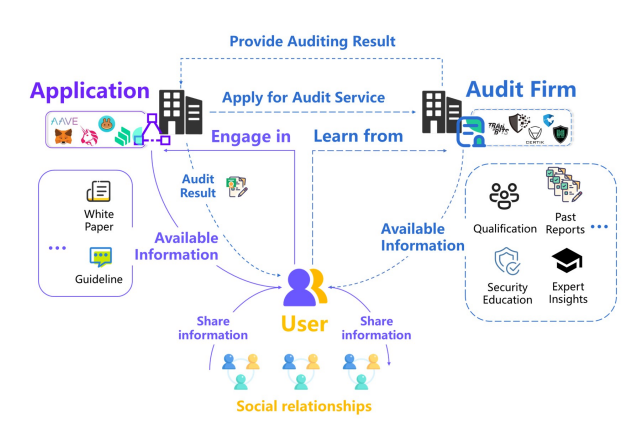
Fig. 3: The framework for Web3 auditing encompasses stakeholders, information exchange, and interactive behaviors. Web3 audit firms engage with users in the Web3 ecosystem by providing auditing services to applications and disseminating security information. These information revelation changes can potentially influence users' security awareness and decision-making processes [7].

Inspired by the risk perception model [9], we developed a framework for Web3 auditing that encompasses stakeholders, information exchange, and interactive behaviors (Figure 3). Web3 auditing impacts the ecosystem by providing audit services to Web3 applications. Moreover, audit-related information and other security information disseminated by audit firms reach users, potentially affecting their awareness and behaviors, such as decision-making. These user behaviors, in turn, exert influence on the Web3 ecosystem.