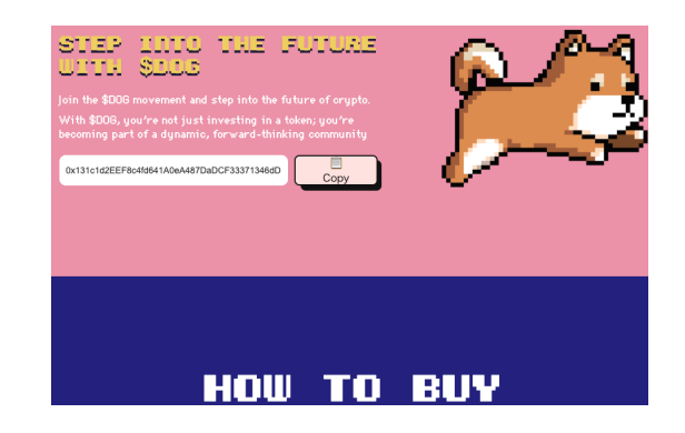
Fig. 3. Token Project's Specific Website